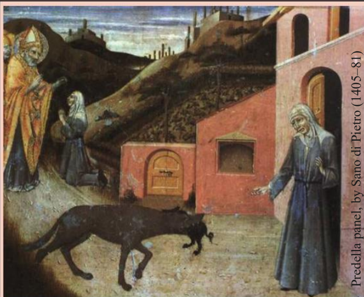
Predella panel, by Sano di Pietro (1405-81)

On February 3, the Church celebrates St. Blaise, a third-century Armenian bishop who was renowned for effecting miraculous cures and for courageously reproaching Roman officials in his home region of Cappadocia for their intolerance of the practice of Christianity. For both reasons, the governor ordered the bishop's arrest, and he took to the wilderness, continuing his ministry in caves. It was said that wild animals came to him for healing and gathered around his cave, while Blaise walked among them unafraid. One story tells of a woman whose piglet was carried off by a wolf. She reported the theft to the bishop, knowing of his rapport with animals. Blaise called for the wolf and commanded the piglet be returned to its owner. The wolf obeyed. The piglet's owner reciprocated Blaise's kindness when he was eventually captured and imprisoned, by bringing him candles to illuminate his dark, cold, damp cell, enabling him to read Scripture. For centuries St. Blaise has been invoked against maladies of the throat, perhaps originating